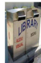
BOOK DROP BOX